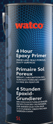
4 Hour Epoxy Primer

©2024 Watco Industrial Flooring/Rust-Oleum watcofloors.com Manufactured & Printed in the USA