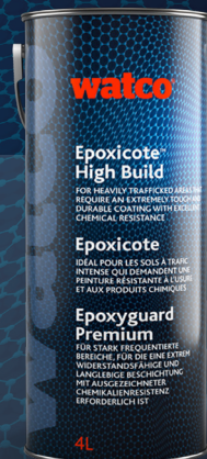
Epoxicote High Build Rapid